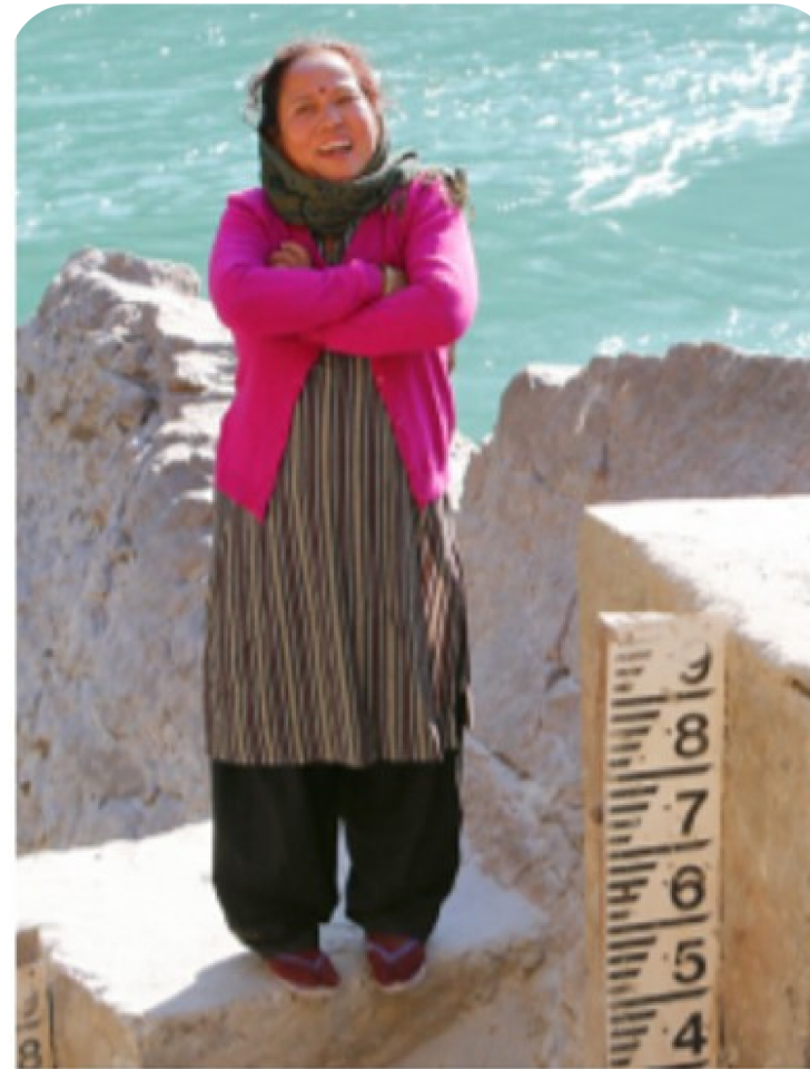
Manual rain gauge for river monitoring